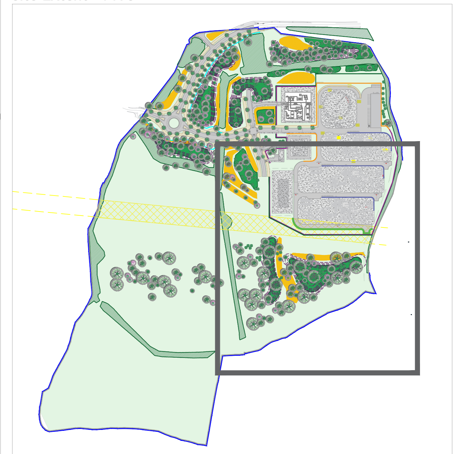
Site Extent - NTS

Concrete (to Engineer's Specification) In-situ concrete. Brushed with trowel edge finish or similar approved